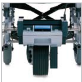
Inserting the viamobil