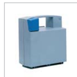
Rechargeable battery pack