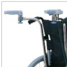
Additional handgrips – make travelling easier