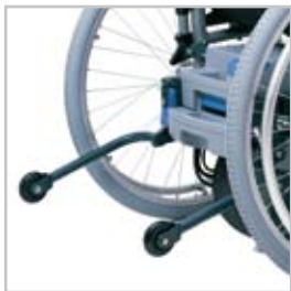
Anti tippers – prevent tipping backwards

These functional accessories make viamobil to be customised to suit individual requirements.