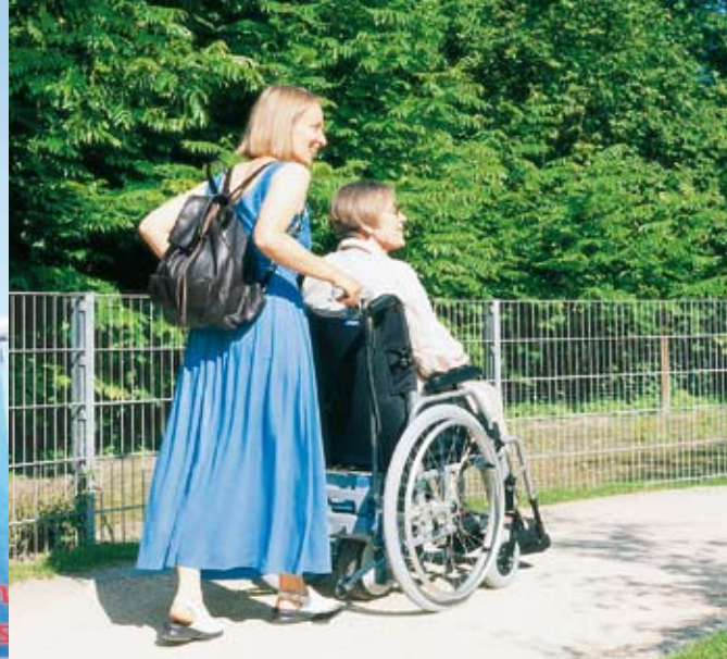
Enhancement of everyday life