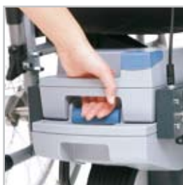
Placing the battery pack on top

NEW! Removing the battery pack with one movement