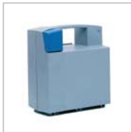
Spare battery pack – increases the range