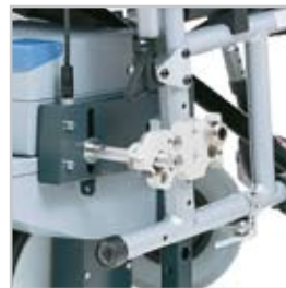
Bracket – compatible with the scalamobil