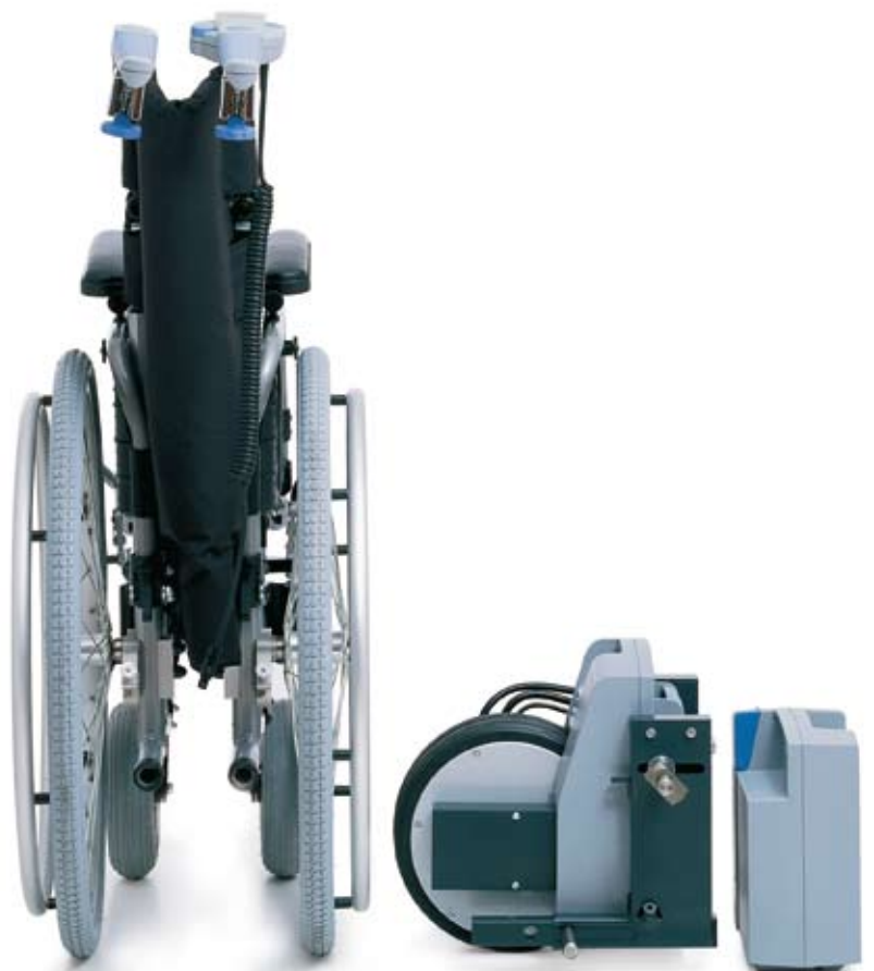
viamobil – rapidly dismantled and easy to transport.

viamobil – quality of life for the user, less strain for the carer.