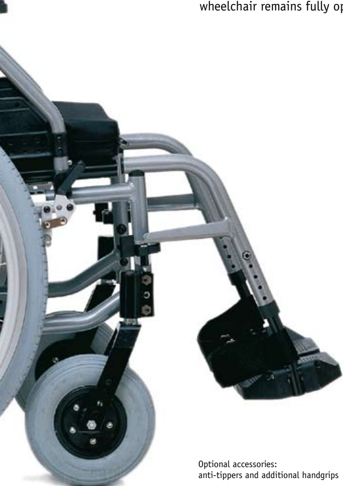
Optional accessories: anti-tippers and additional handgrips

The powerful electric motor is tucked away under the seat and held by a quick-lock device. The handy rechargeable battery pack is securely attached to the drive and is automatically locked into position. To charge the battery pack, there is an automatic charger supplied. The viamobil is operated by an ergonomically designed control unit.